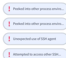
Stitched attack phases shown in the dashboard threat progression