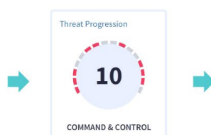
Command and control shows the stitched attack stages and the movement progression